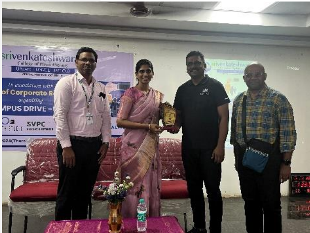
organization of the recruitment dri