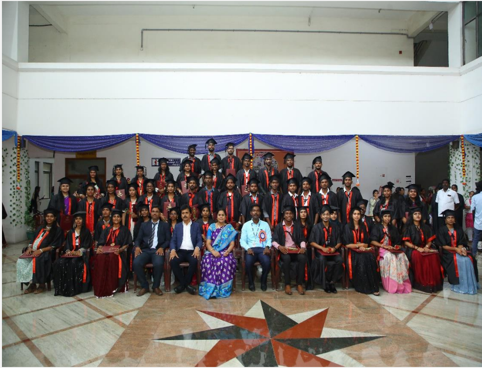
Picture Caption: Proud moment! Celebrating the achievements of our graduating MPT & BPT students at Sri Venkateshwaraa College of Physiotherapy.

On the 25th of July, 2024, Sri Venkateshwaraa College of Physiotherapy (SVCOPT) celebrated the graduation day for the 7th